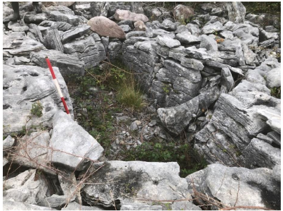
Plate 4: CH C, facing southwest

The site will not be directly impacted by the proposed N6 GCRR, being 72m away from the proposed development boundary. Given the level of dense vegetation in the area between the feature and proposed N6 GCRR, indirect negative impacts are not predicted. The level of predicted impact is deemed to be neutral and no further mitigation is required.