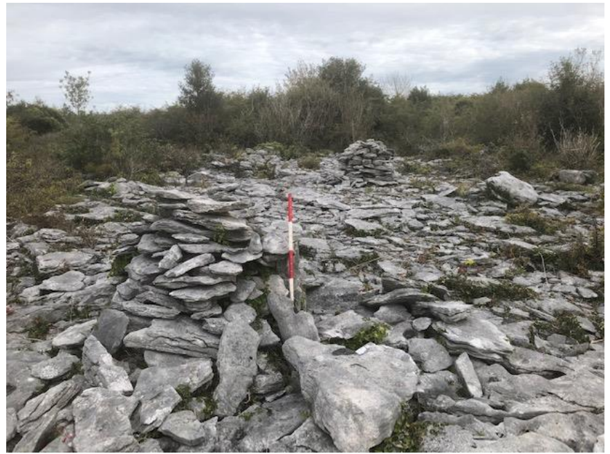
Plate 3: CH B, facing north

The site will not be directly impacted by the proposed N6 GCRR, being 65m away from the proposed development boundary. Given the distance of the site from the proposed N6 GCRR and vegetation that lies in between, indirect negative impacts are not predicted. The level of predicted impact is deemed to be neutral and no further mitigation is required.