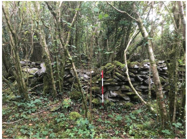
Plate 1:CH A, facing northeast

The field boundary that the site abuts is not present on the first edition OS map of 1841, but is marked by the time of the 1895-1900 map. This suggests the earliest date of the feature is mid-19th century, although it is not marked on any of the historic mapping. It is possible that the enclosure represents the remains of a pen or enclosure for livestock, which were a common feature of the post medieval landscape, especially in marginal terrain, such as the environs surrounding the site, where stock may range a wide area.