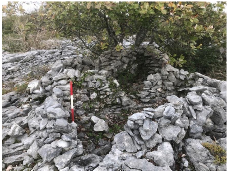
Plate 5: CH D, facing northwest

This small built feature is located c. 92m southwest of the proposed road scheme within an area of limestone pavement. The feature comprises two small rectangular areas defined by roughly constructed drystone walls (Figure 1, Plate 5). The upstanding walls stand to a height of c. 1m and the walls abut a stone field boundary wall, which is first marked on the 1928-29 OS map. This indicates that the feature was constructed between 1895 and 1929. The function of this feature is not clear, but it may have been used as a booley hut or similar small shelter, in use whilst animals were being tended in a marginal landscape.