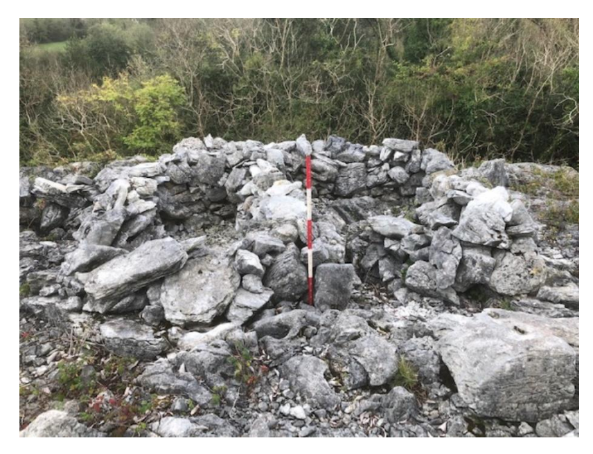
Plate 6: CH E, facing southwest