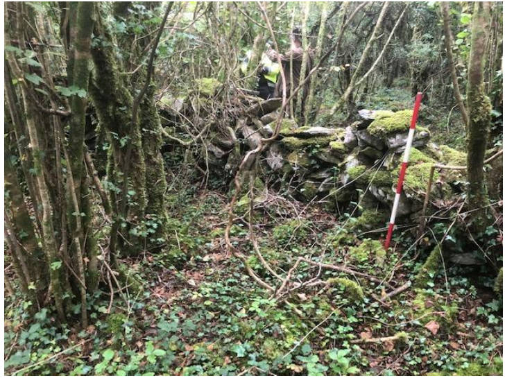
Plate 2: CH A, facing southwest